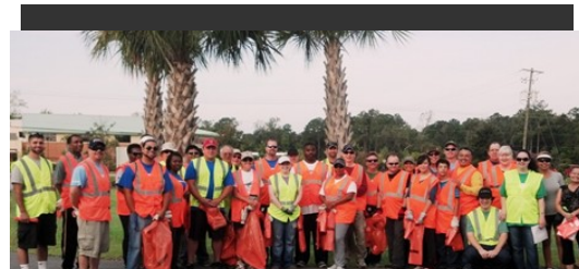
Boeing South Carolina Adopt-A-Highway Volunteers

Top Volunteer Team: Boeing South Carolina In 2012, 115 volunteers removed 2,025lbs. of litter!